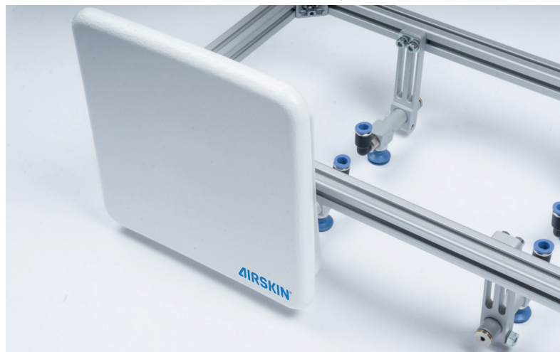
How to mount a AIRSKIN® Modul Pads on aluminium profiles

The autonomous pads are connected to the controller's safety IOs by a 6-wire cable carrying two redundant safety channels. Functional safety is ensured by constant self-diagnosis of the sensor pads. AIRSKIN® fully complies with ISO 13849. It is certified as a PLe Cat.3 safety device by TÜV Austria.