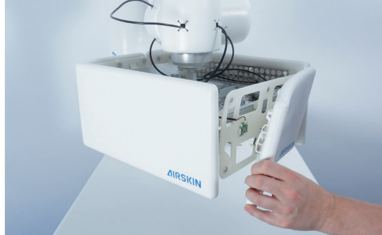
AIRSKIN® Modul Pads allow you to diversify your safety solution for grippers.